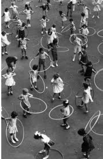
Hoola Hoops all the rage