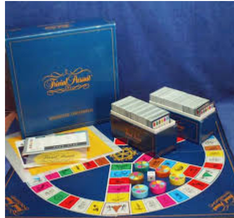
First Trivial Pursuits game