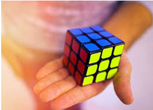
Rubik's Cube craze