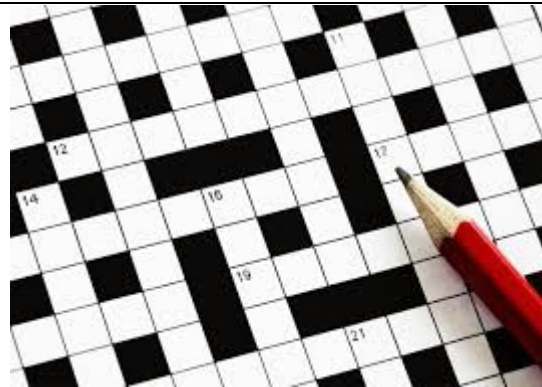
Crossword first published